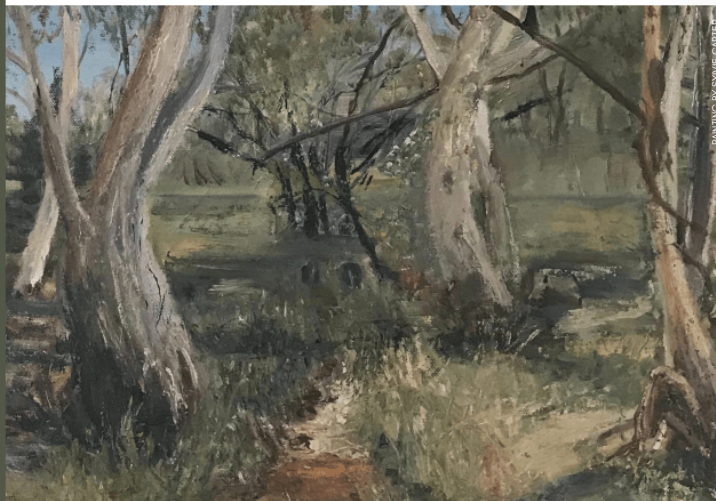
PAINTING BY SYLVIE CARTER